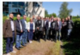
M18 meeting, 15 May 2019, at IEMN, Lille