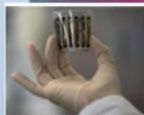
LAYER ® OPV module by inkjet printing