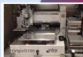
Inkjet printer in the Dracula Technologies' LAYER ® LINE